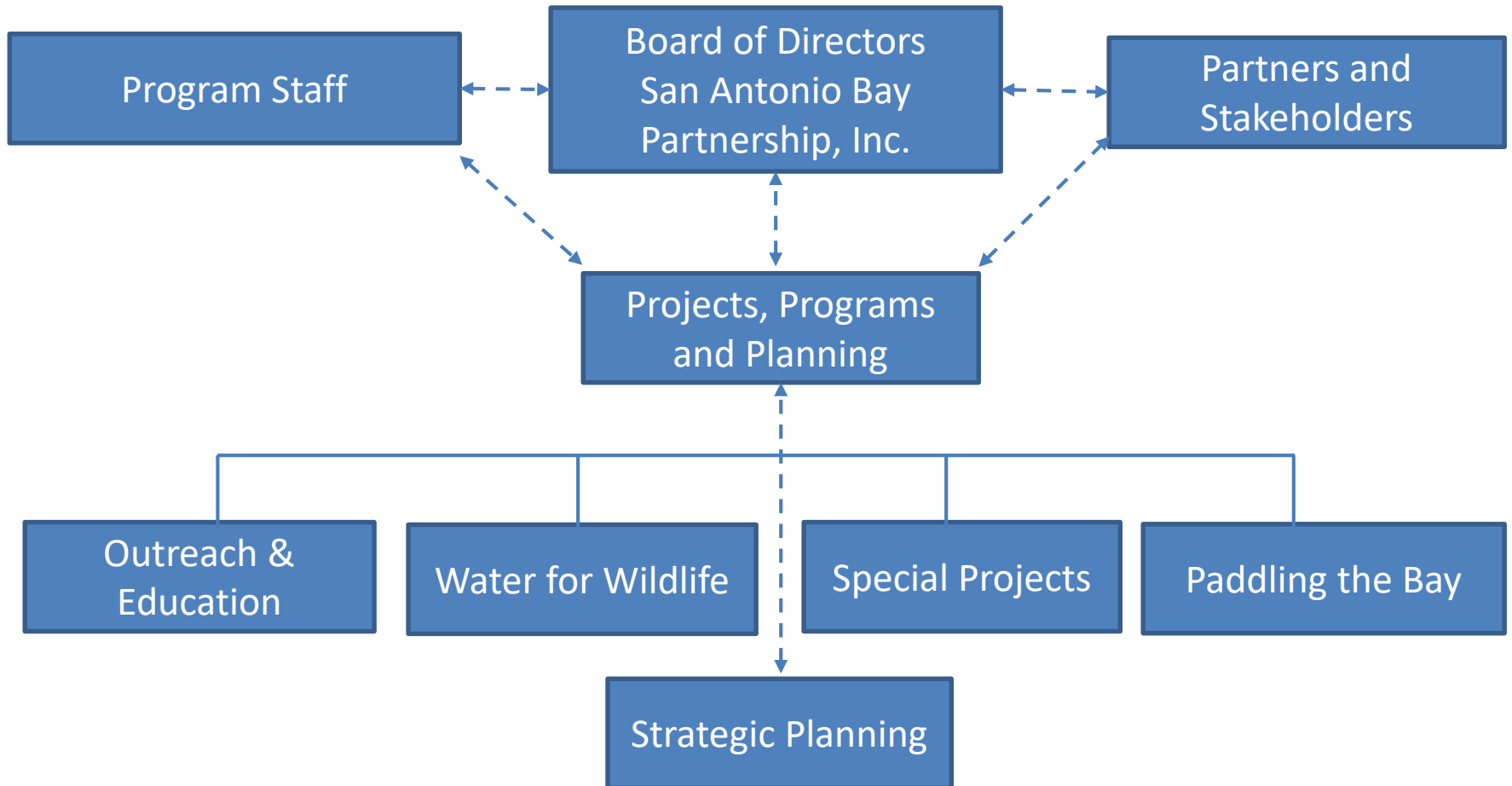
Functional Organizational Structure for the San Antonio Bay Partnership At Present