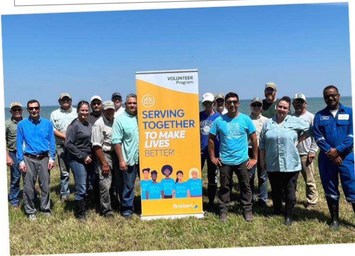
Braskem Cleanup, Powderhorn WMA

Three hundred twenty-four bags of trash collected, including 2276 plastic beverage bottles, in half a day's effort by 183 concerned citizens, is an admirable effort. But is also indicative of a significant problem effecting our bays: plastic marine debris. While plastics have brought great benefits, we must keep them out of our bays.