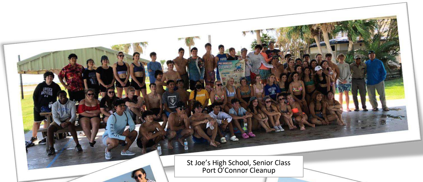
St Joe's High School, Senior Class Port O'Connor Cleanup